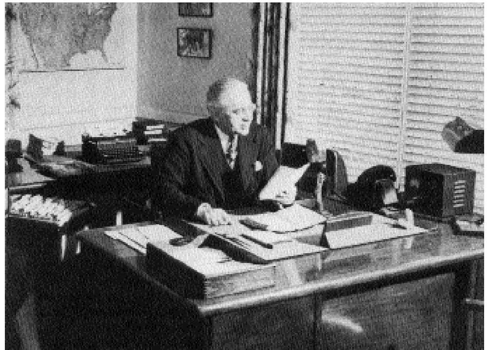
PHOTO SHOWS Herbert W. Armstrong making an early World Tomorrow radio broadcast. From the smallest beginnings, God's work has grown to international scope, carrying the true gospel to all the world as a final end-time witness.

Jesus came as a messenger from God bearing a message about the coming kingdom of God to take over and rule all nations.